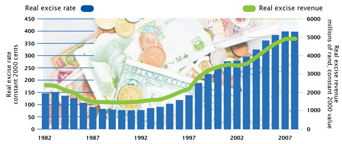
Inflation-adjusted cigarette taxes and cigarette tax revenues, South Africa, 1982–2008